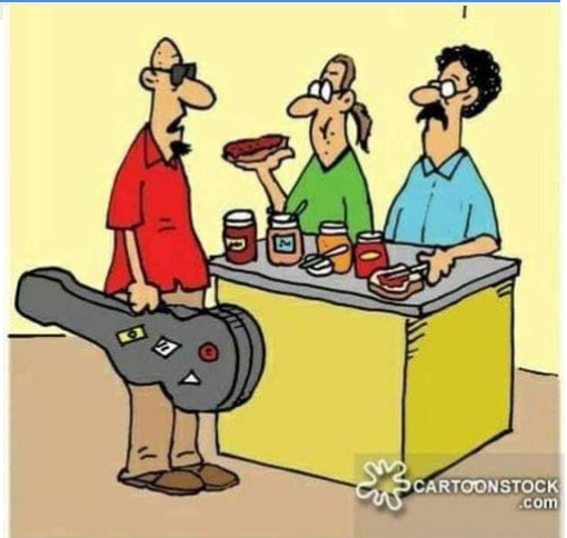
"WHEN YOU GUYS INVITED ME OVER FOR A JAM SESSION, I JUST ASSUMED..."