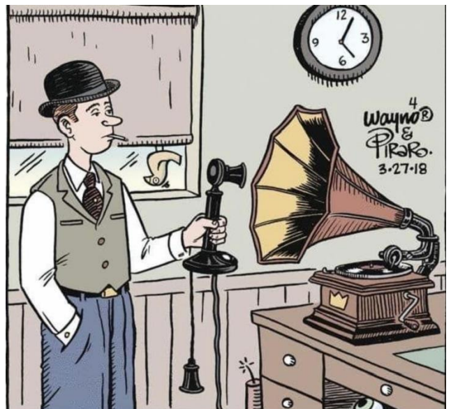
OLD-SCHOOL MUSIC STREAMING