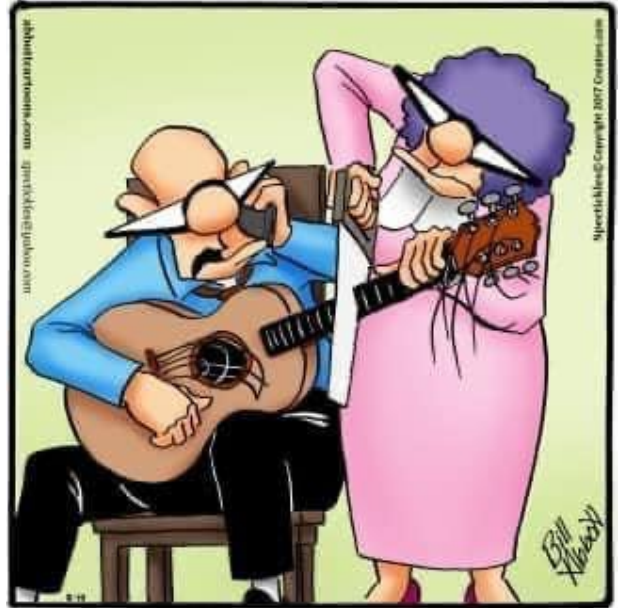
"Actually, you've called at the perfect time. My wife is giving me the signal to quit practicing."