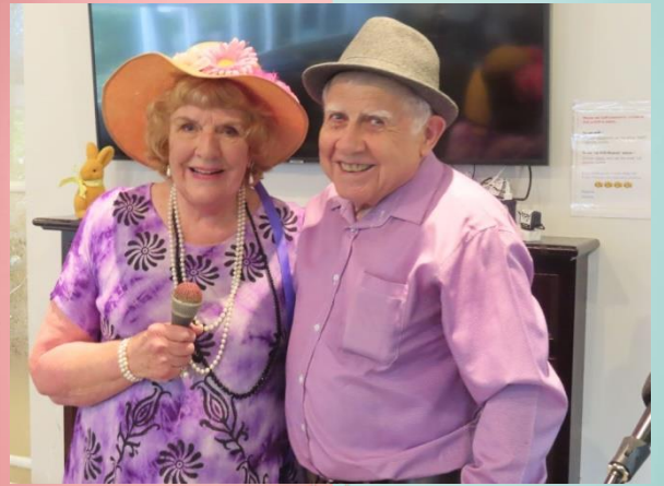
Duo Melodica at their Easter Concert.