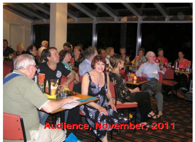
Audience, November, 2011