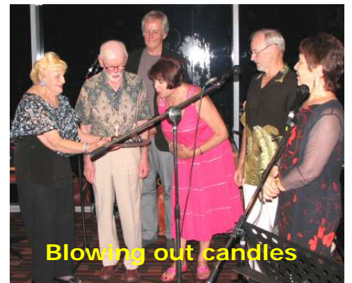
Blowing out candles