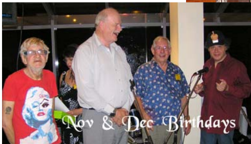
Nov & Dec Birthdays